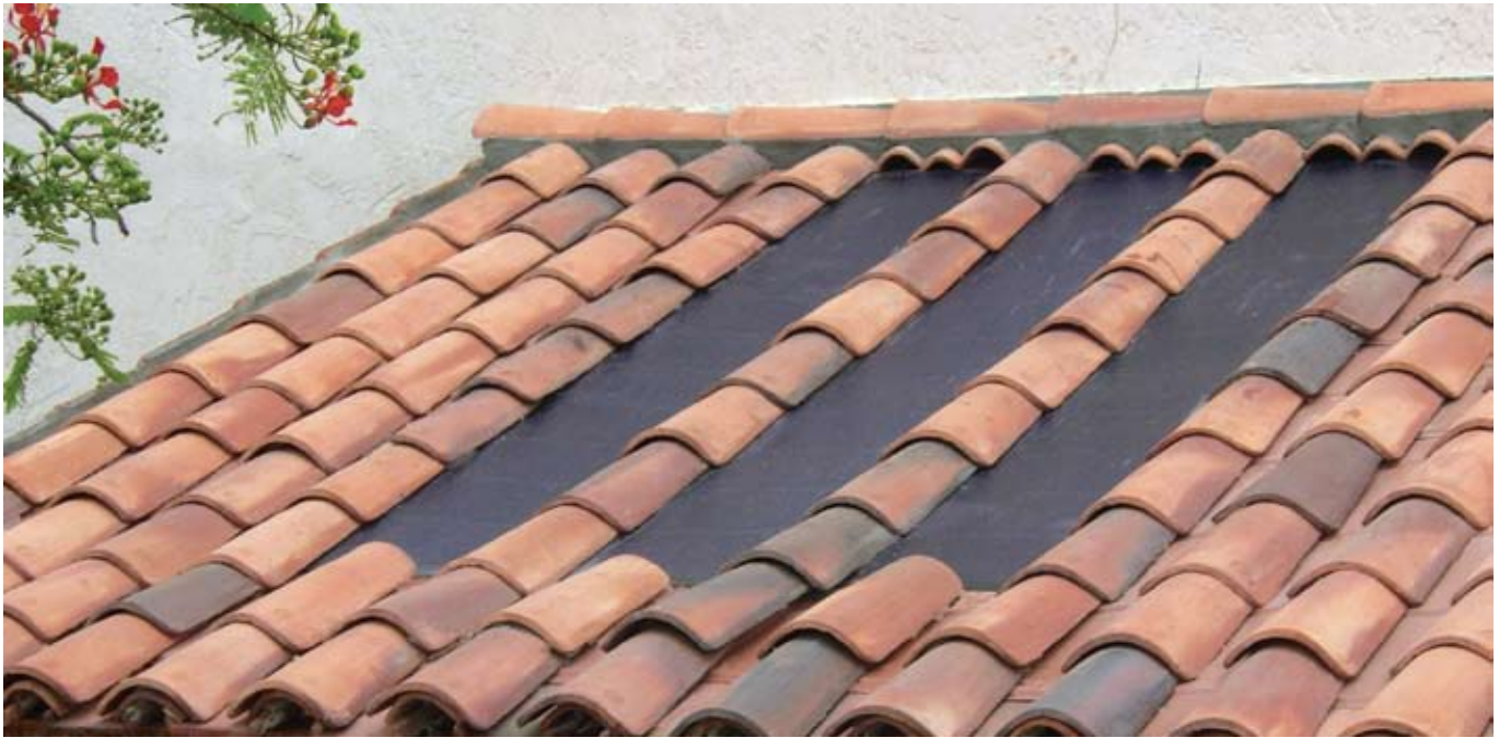
The Universal Hybrid Roof Tile System with integrated photovoltaics.

We have created a patented Miami-Dade County Approved disaster resistant, 100 year, recyclable, panelized, easy-to-install traditional roof tile system that can support aesthetically integrated photovoltaic and green roofing technologies.